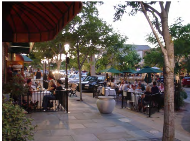
Outdoor Dining: Flex Zone