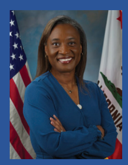
Laphonza Butler U.S. Senator