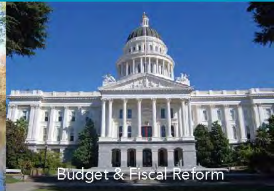
Budget & Fiscal Reform