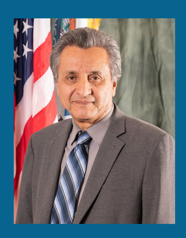
Councilmember ILG Public Engagement & Equity Advisory Council & City of East Palo Alto